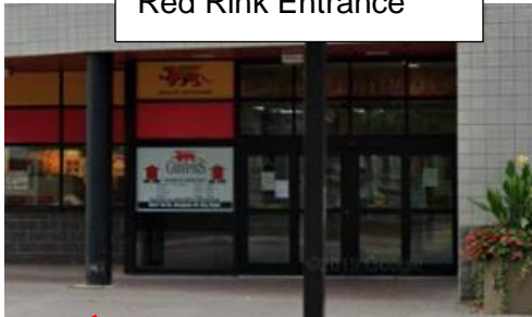
Red Rink Entrance